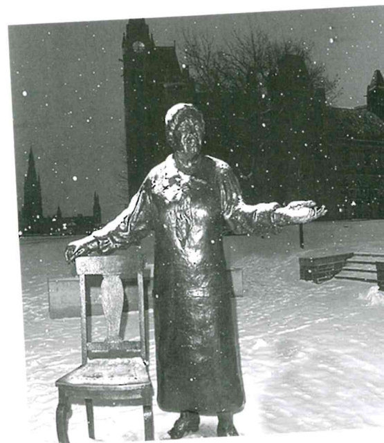
Women Are Persons Monument, Parliament Hill, Ottawa. Unveiled on October 18, 2000, this monument marked the first time women were honoured on Parliament Hill. The grouping of statues does not actually look like these photos. The individual figures are spaced in a rectangular formation and spread apart quite a bit.

Why is it important that this monument be located in Ottawa? Why do you think